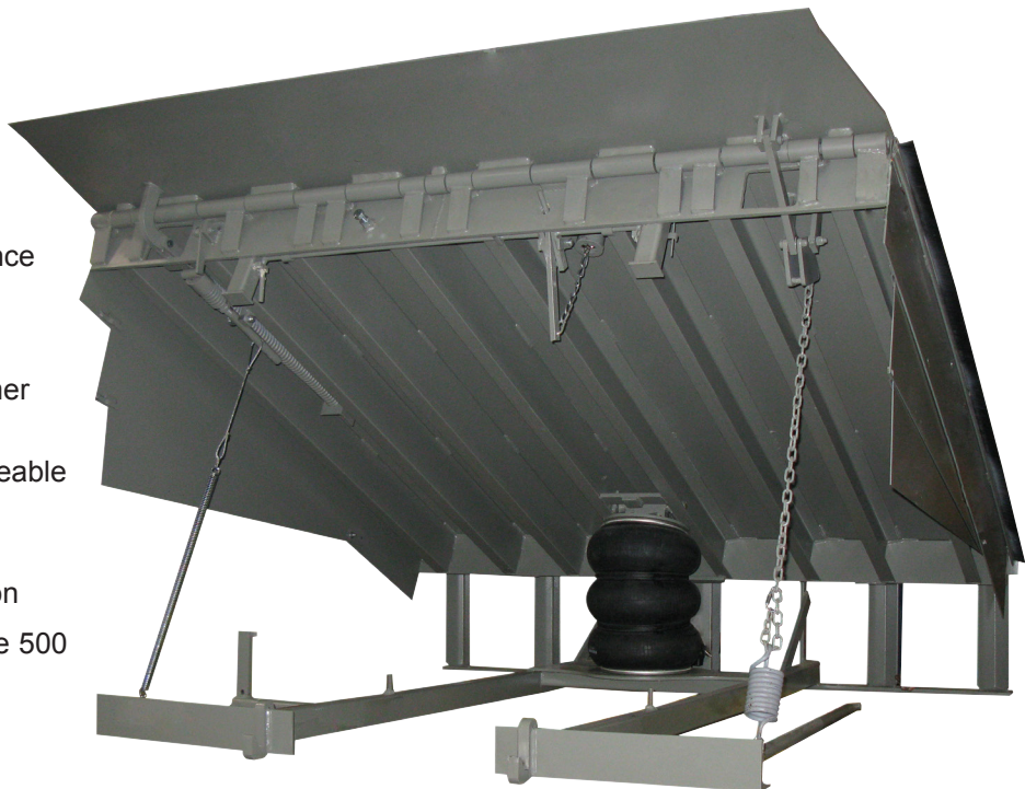
CentraAir Series, 7' x 8', 35,000 CIR, with brush weather seal.