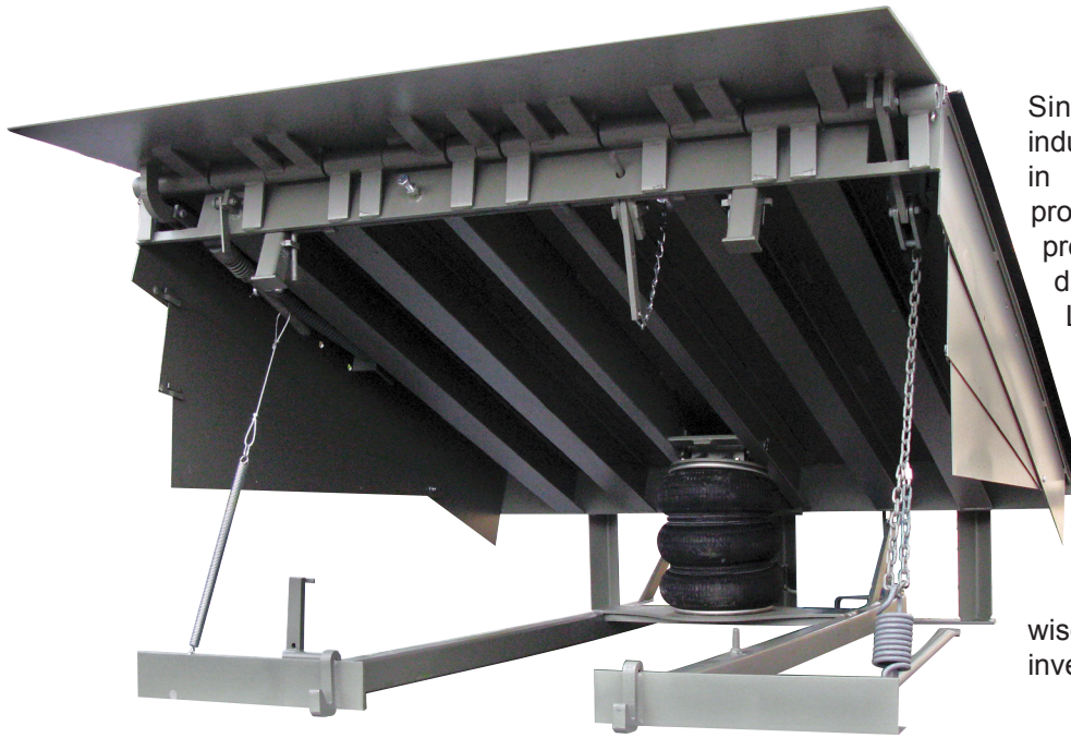
CentraAir Series, 6' x 8', 45,000 CIR, Full Range Toe Guards.

Since introducing the “freight industry’s” first Edge-of-Dock leveler in 1962, DLM has continued to provide innovative ways to improve productivity and safety at the loading dock. The CentraAir® Series Leveler combines the “push-button” convenience of hydraulic levelers with the economics of a mechanical leveler to bring value and performance to your loading dock. From superior structural design to unlimited operator features, the CentraAir Series air powered leveler is a wise and environmentally friendly investment.